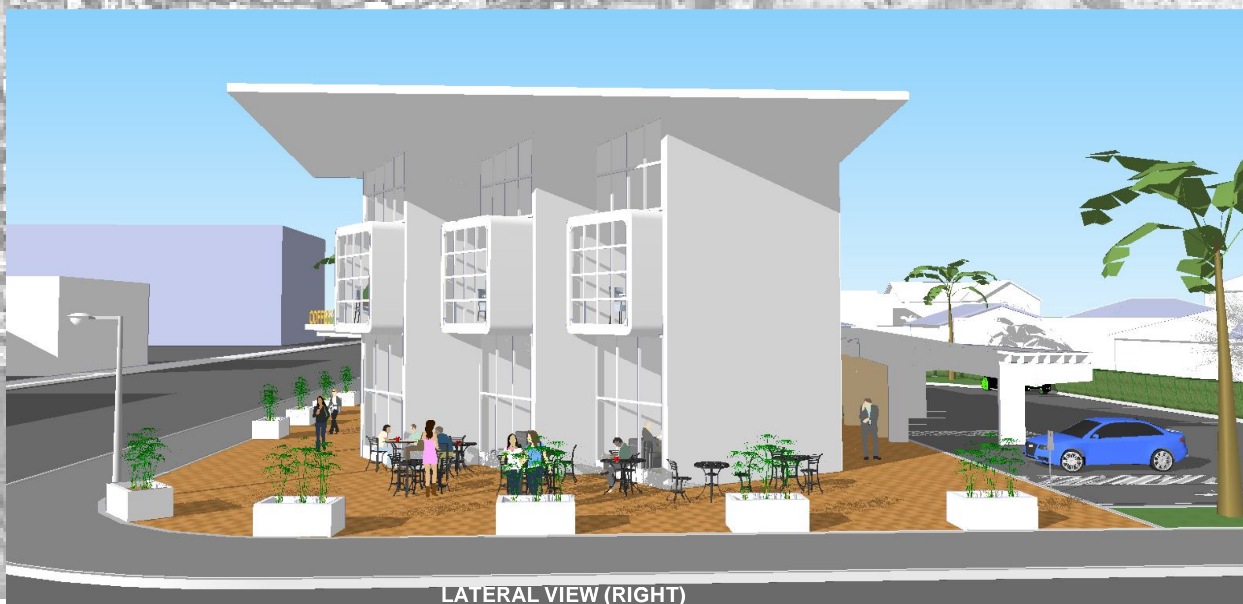
LATERAL VIEW (RIGHT)