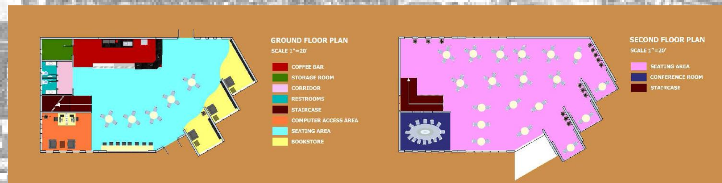
GROUND FLOOR PLAN SCALE 1"=20' COFFEE BAR STORAGE ROOM CORRIDOR RESTROOMS STAIRCASE COMPUTER ACCESS AREA SEATING AREA BOOKSTORE