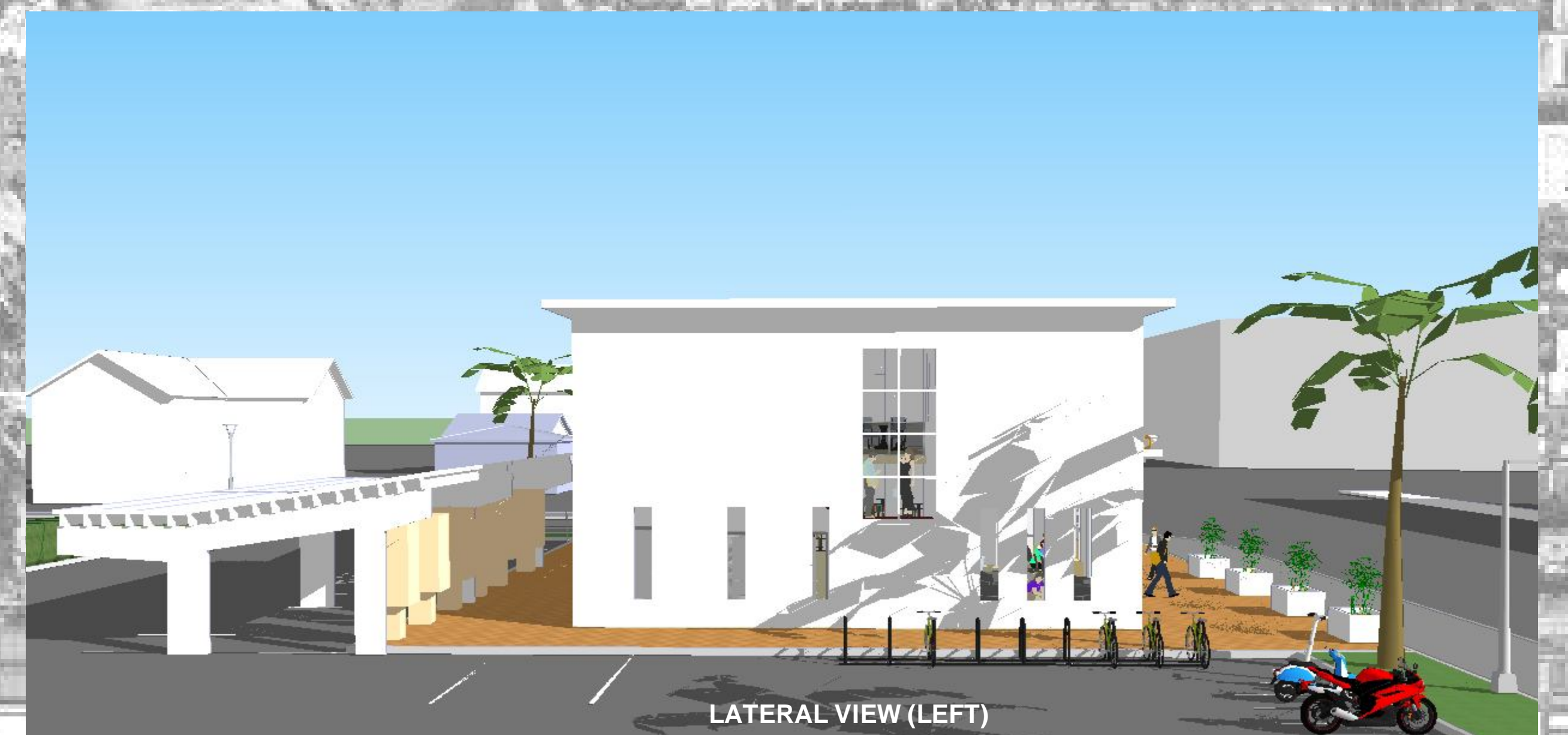
LATERAL VIEW (LEFT)

FLORENTA NICOLETA TANASE SPIRU HARET UNIVERSITY