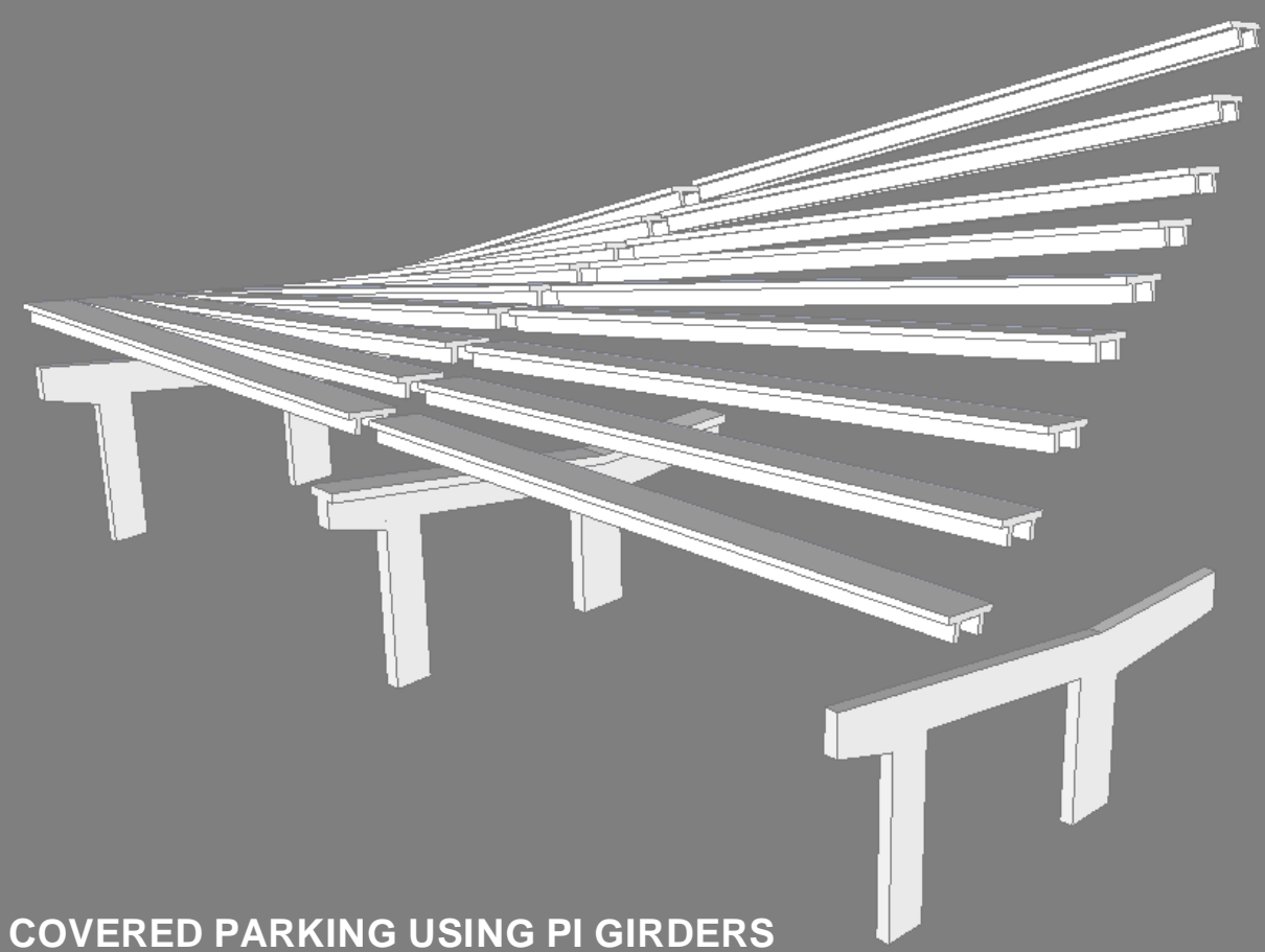
COVERED PARKING USING PI GIRDERS