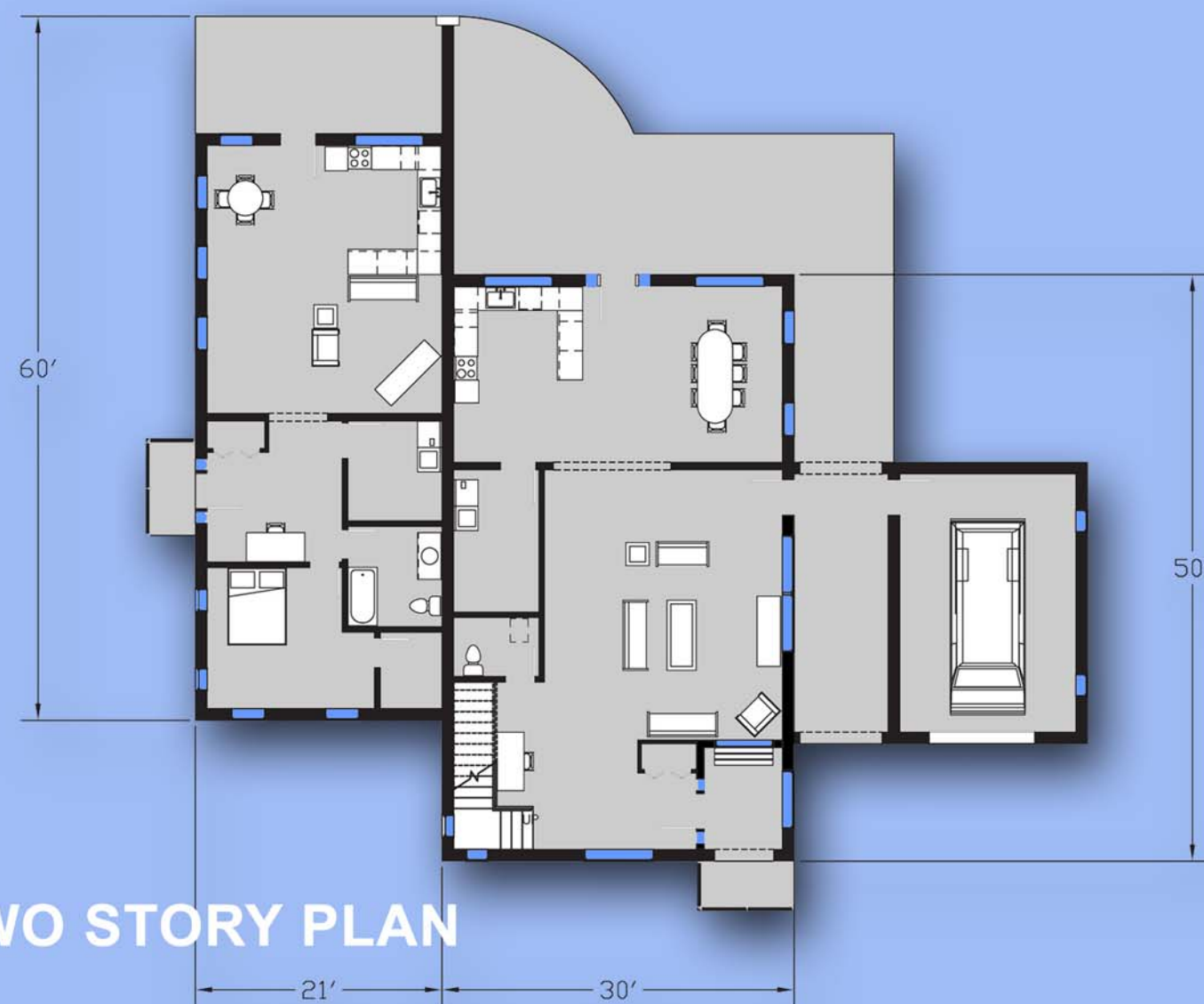
-TWO STORY PLAN