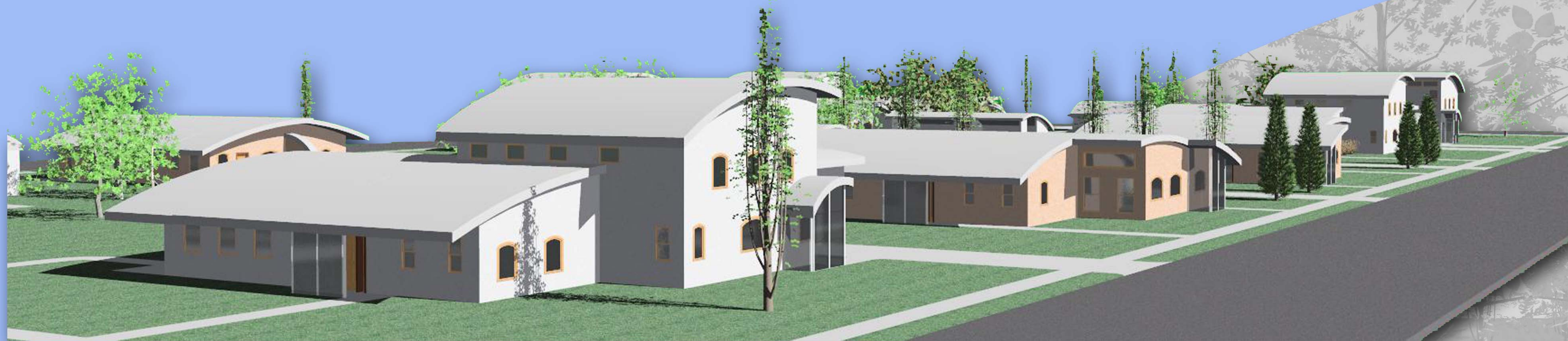
-STORM RESISTANT COMMUNITY