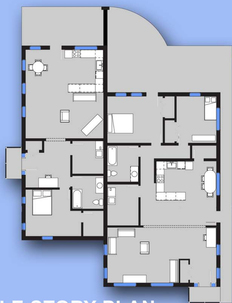
-SINGLE STORY PLAN