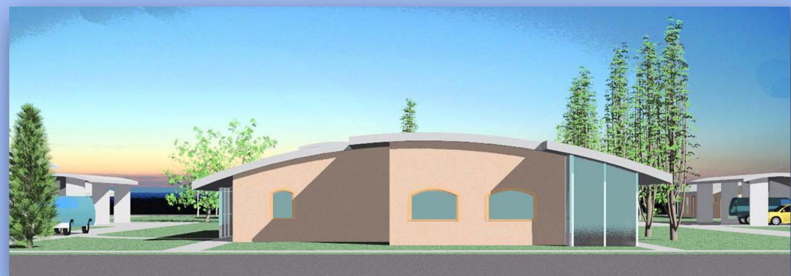
-FRONT ELEVATION SINGLE STORY UNIT