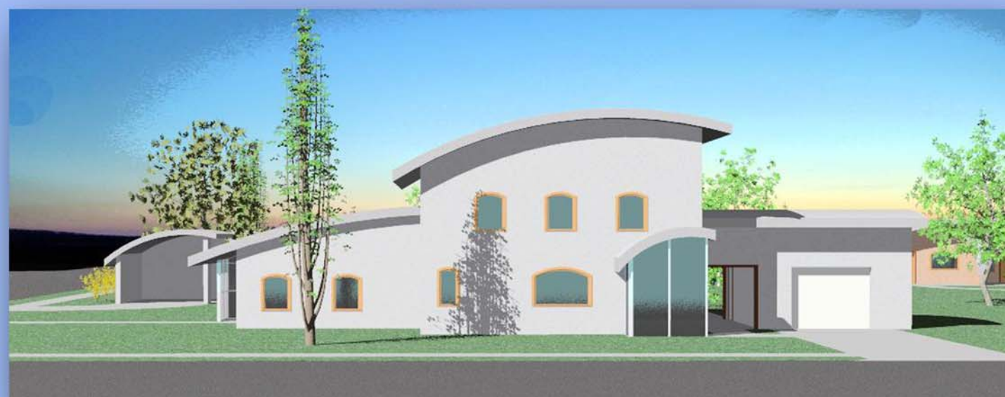
-FRONT ELEVATION TWO STORY UNIT